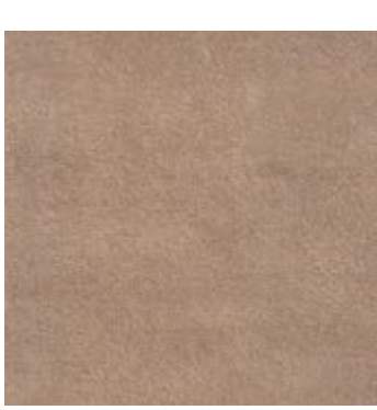
DREAM 0040 HAZELNUT