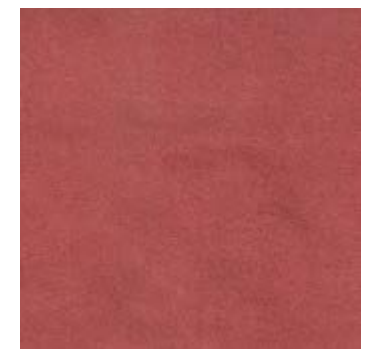
DREAM 0069 DARK RED