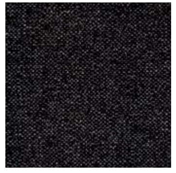
CAMPA 990 BLACK