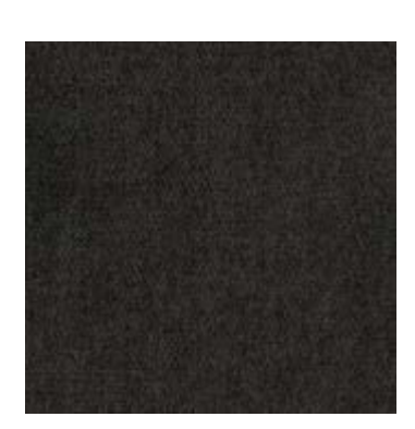
CAPRICE 104 GRANITE