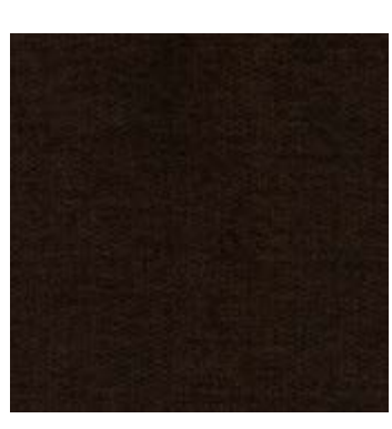
CAPRICE 106 JAVA