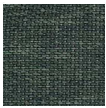
HABITAT 705 TEAL