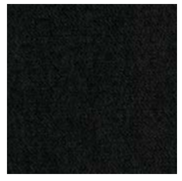
CAPRICE 107 CHARCOAL