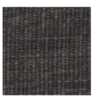
HABITAT 703 GREY