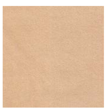
DREAM 0086 YELLOW