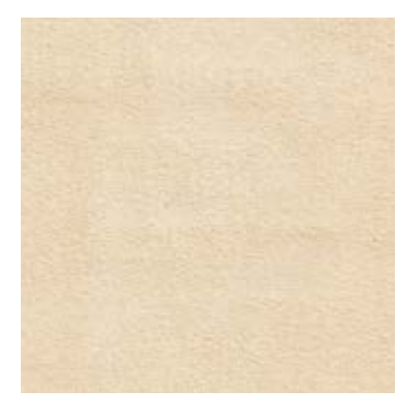
DREAM 0002 BEIGE

BS 5821 P.1 source 0 Calif. Bul 117 Sec. E