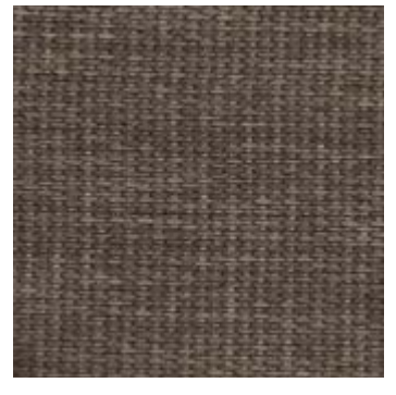
HABITAT 701 PUMICE

100% Polyester >30,000 (160 000) 5 4-5 Foam Cleaning/Wash 40° EN 1021-1 (Cigarette) BS 5821 P.1 source 0 Calif. Bul 117 Sec. E