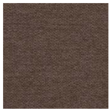
CAPRICE 102 CASHMERE