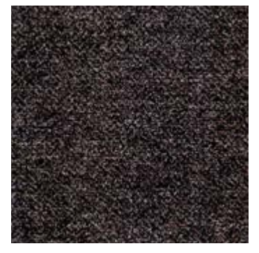
CAMPA 930 STONE