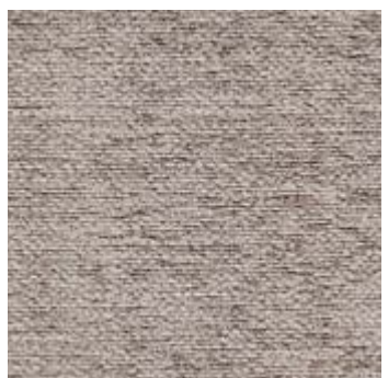
CAMPA 260 SAND