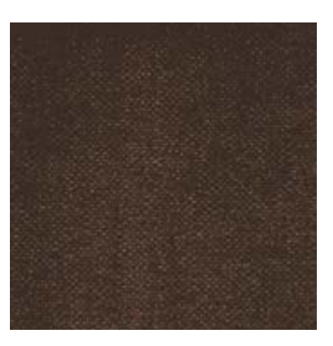
CAMPA 870 CHOCOLATE