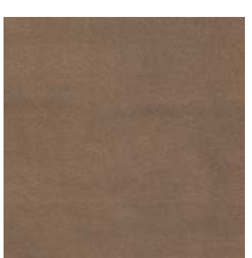
DREAM 0016 COFFEE