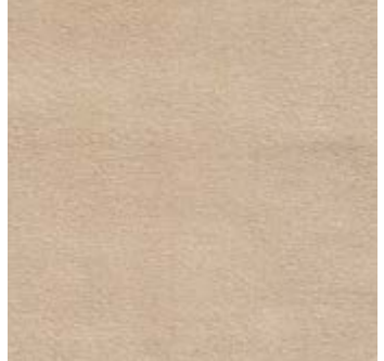
DREAM 0078 LATTE