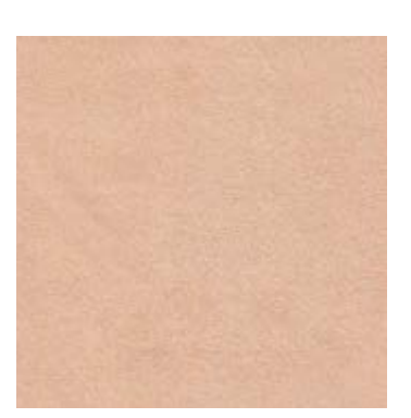
DREAM 0025 DARK BEIGE