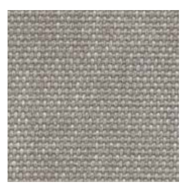
HABITAT 713 ALMOND