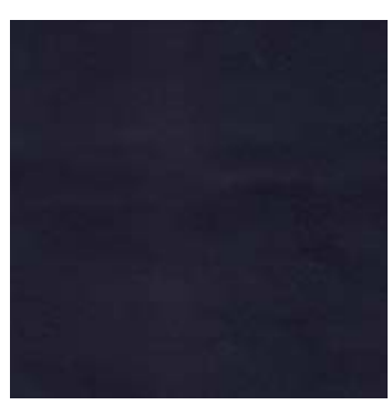
DREAM 0998 ANTHRACITE