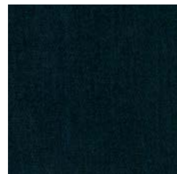
CAPRICE 112 PETROL