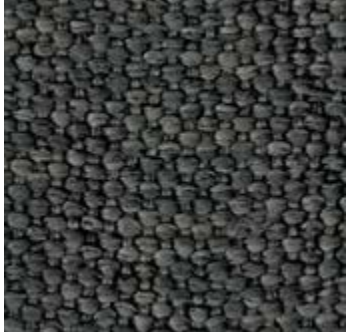
HABITAT 711 STEEL