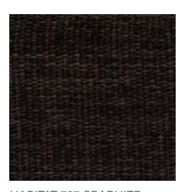
HABITAT 707 GRAPHITE