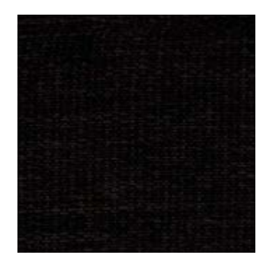
HABITAT 709 EBONY