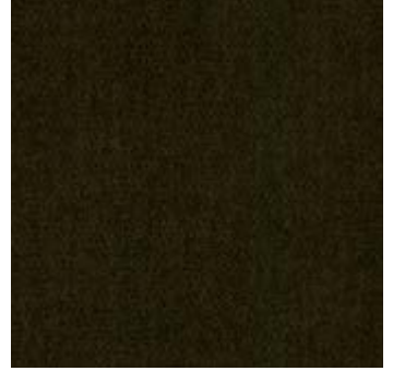
CAPRICE 110 CEDAR